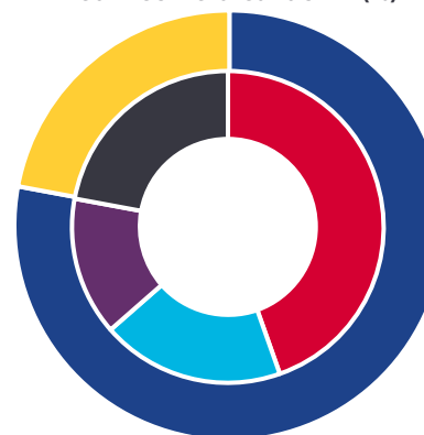
Fixed income breakdown (%)