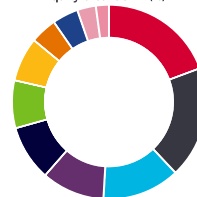
Equity breakdown (%)